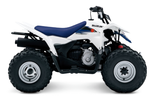
Solid Special White No.2 (30H)